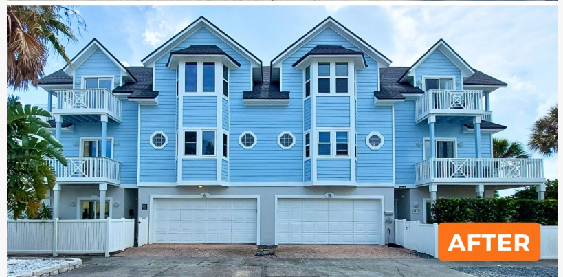
Exterior Before and After Pro Vision