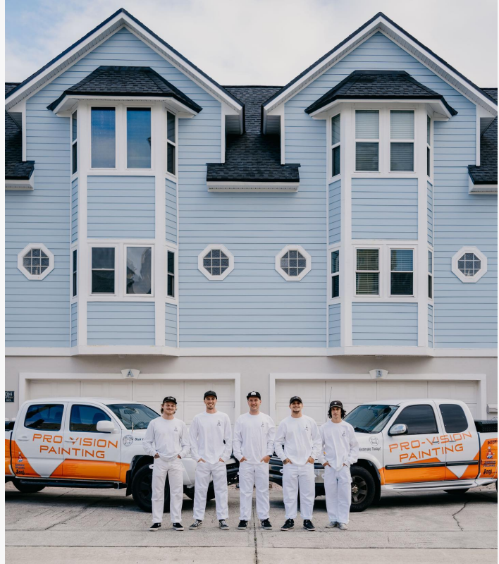
Pro Vision Painting Jax Beach

Core Values: Clearly articulated values of Integrity, Quality, Service, and Communication, which guide every aspect of Pro-Vision Painting's operations.