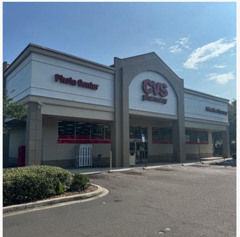
Commercial Painting Jacksonville