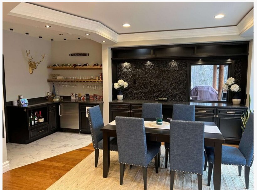
Interior Painting MI