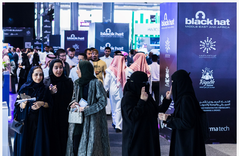
A 52% increase in new brands taking part in the 2024 edition