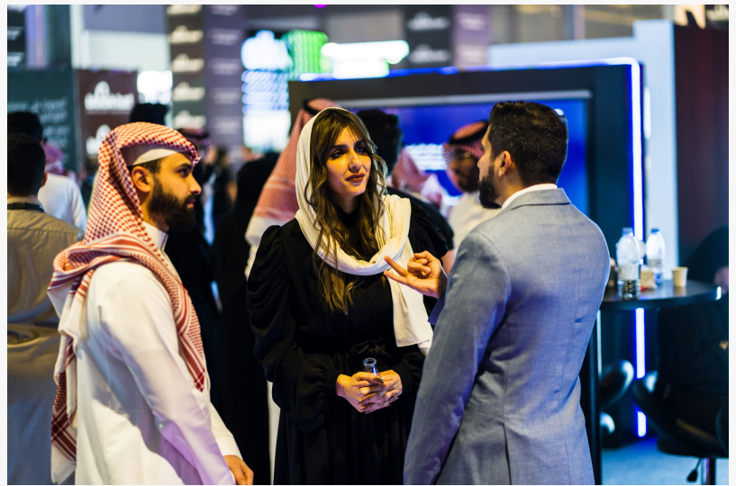
Over 40,000 guests, BlackHat MEA 2024 will witness a 135% increase in startups at the event from 2023