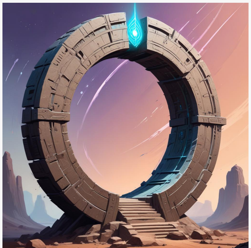
Your Gateway to Owning A Digital Presence