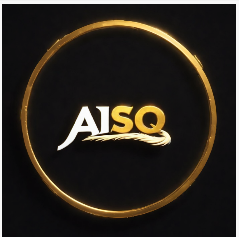
Official Logo of AISQ

AISQ's initial users have already experienced tremendous success with the platform. Early adopters who completed the full automation setup reported that the only actions they needed to take were to approve text and make minor edits—AISQ's Next Level Marketing handled everything else.