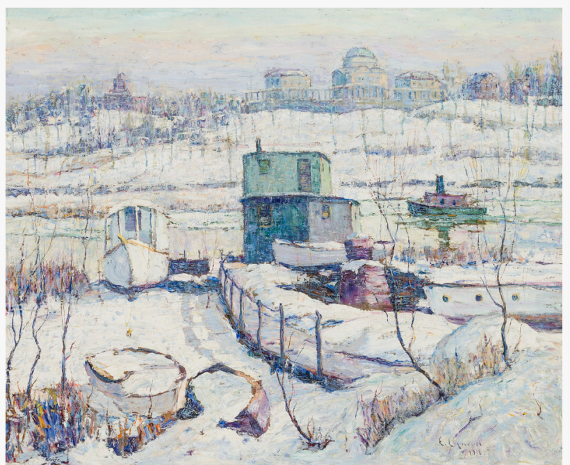
Oil on canvas painting by Ernest Lawson (Canadian/American, 1873-1939), titled Boat House, Winter, Harlem River (1918), signed and dated, 25 inches by 30 inches (est. $100,000-$150,000).

From an important Midwestern collection of American Impressionism, Shannon's will offer Frederick Carl Frieseke 's The Rose Gown from 1915, estimated at $80,000-$120,000. This impressive 32 inch by 32 inch painting depicts a woman in a rose-colored dress holding a posy. Shannon's has attracted a following for Frieseke with recent sales of Lady Trying on a Hat for $450,000 (2023) and Dressing for $112,500 (2024).