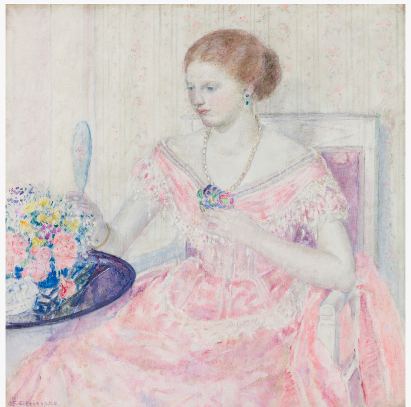
Oil on canvas painting by Frederick Carl Frieseke (American, 1874-1939), titled The Rose Gown (1915), signed, 32 inches by 32 inches (est. $80,000-$120,000).