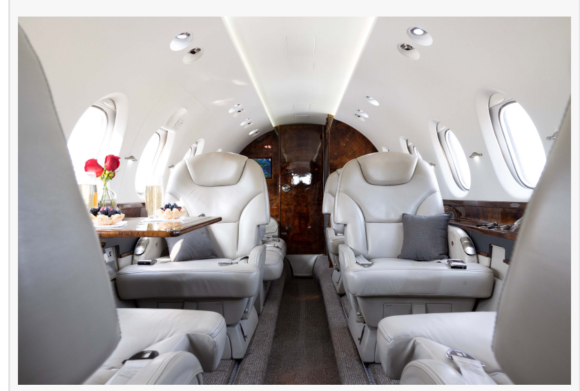
Reata Jet's Hawker 800XP features a stunning, wellappointed interior

Transitioning to Reata Jet exhibits our growth as a company as we expand our horizons while maintaining an unwavering commitment to quality. Beyond chartering aircraft, we're creating an experience that embodies the spontaneity and freedom of private air travel. 'Spur The Moment' captures our dedication to meeting client needs, infused with the genuine spirit of Texas."