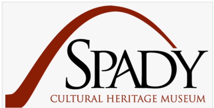
Spady Cultural Heritage Museum

Arts Garage is a Visual & Performing Art Center located in Downtown Delray Beach, Florida that delivers innovative, diverse, meaningful and accessible visual and performing arts experiences to Delray Beach and the South Florida community. From Grammy Award-winning musicians to emerging, local artists, Arts Garage hosts performers representing a broad diversity of cultures. The Marshall Family Foundation Gallery at Arts Garage exhibits emerging visual artists from the South Florida region and provides educational programming for both adults and children to grow their talents and knowledge of the Visual & Performing Arts. Located at 94 NE 2nd Avenue in Delray Beach's popular Pineapple Grove (33444), Arts Garage is a 501(c)(3) nonprofit