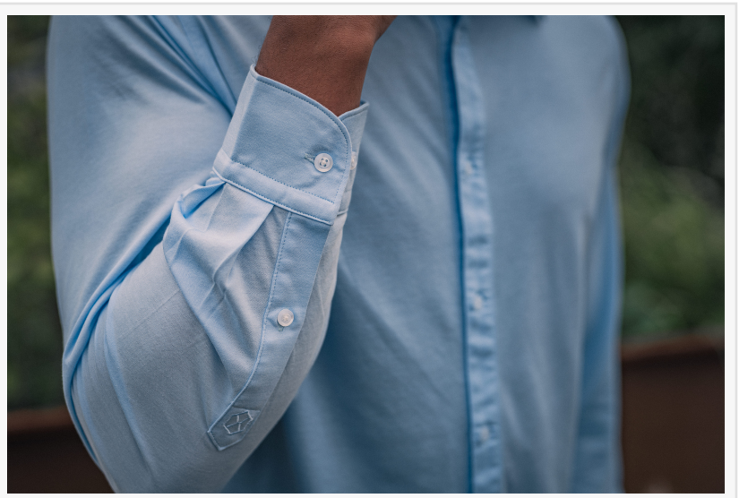
Available in white and light blue

** Kickstarter Campaign Details: Graphene-X has a solid track record of successful crowdfunding campaigns (this is their tenth campaign), and the