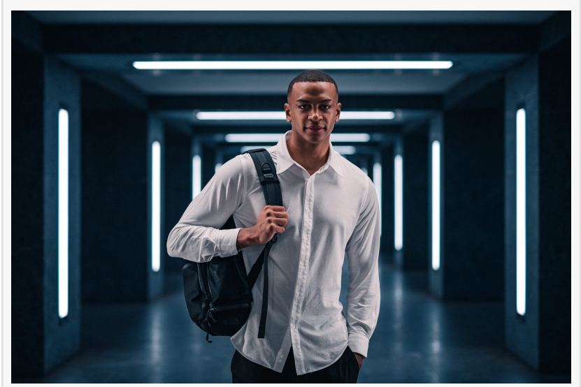
A shirt that nourishes your skin with probiotics

Performance Tech Shirt is no exception. With multiple options available for backers, the campaign is set to deliver this high-tech apparel to early supporters by December 2024.