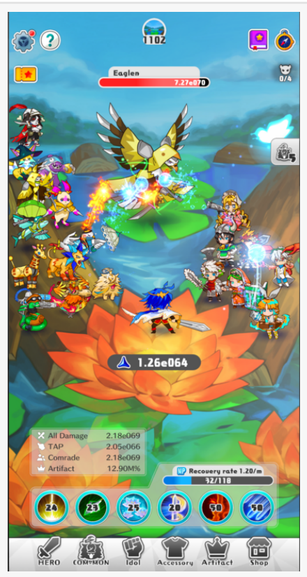
Proceed! COMRADE FORCE2