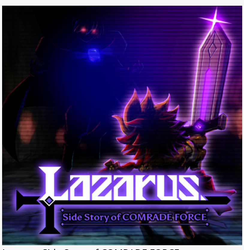
Lazarus -Side Story of COMRADE FORCE-