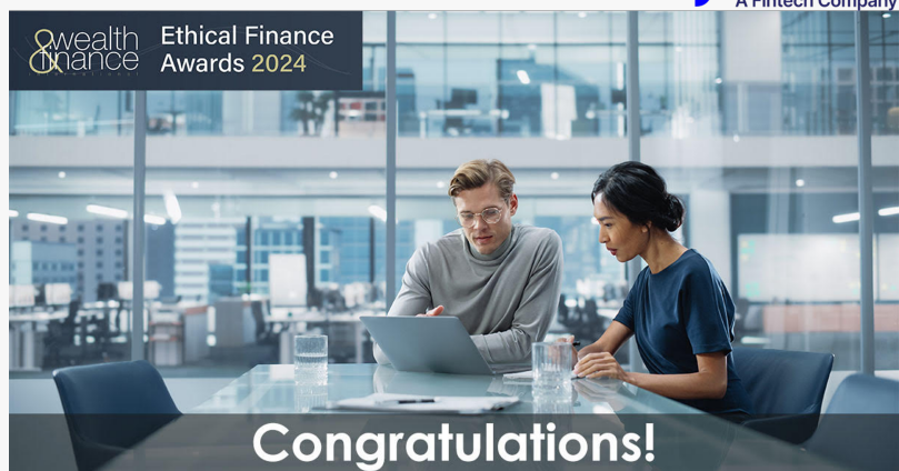
PayToMe.co - Ethical Finance Award Winner

This press release can be viewed online at: https://www.einpresswire.com/article/752142019