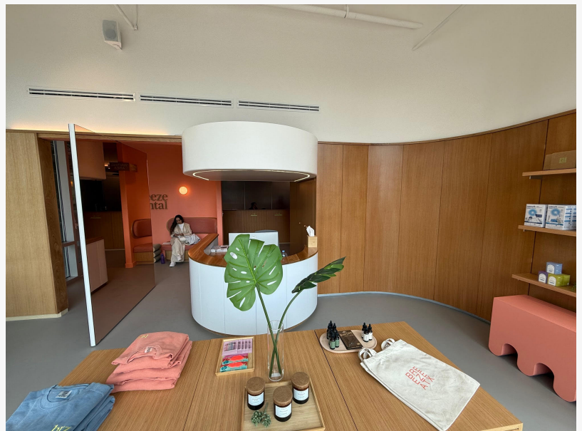
Breeze Dental 38th St Interior