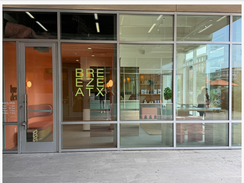
Breeze Dental 38th St Exterior

About Breeze Dental: Breeze Dental is a leader and innovator in the dental industry, providing a new dual-care model that focuses on preventing problems before they start. The brand introduced Austin's first-ever hygiene-focused dental clinic, Breeze Hygiene, which offers regular check-ups, cleanings, and no drills or drilling. This, along with Breeze Restore offices, provides a full scope of dental services including cosmetic, restorative, and preventative maintenance. Together with the brand's patient-first amenities such as the Breeze App, flexible appointments, and cutting-edge, AI-enhanced X-ray technology, Breeze aims to address patients' root issues with preventative and holistic care. Please visit https://breezeoralcare.com/ for more information.