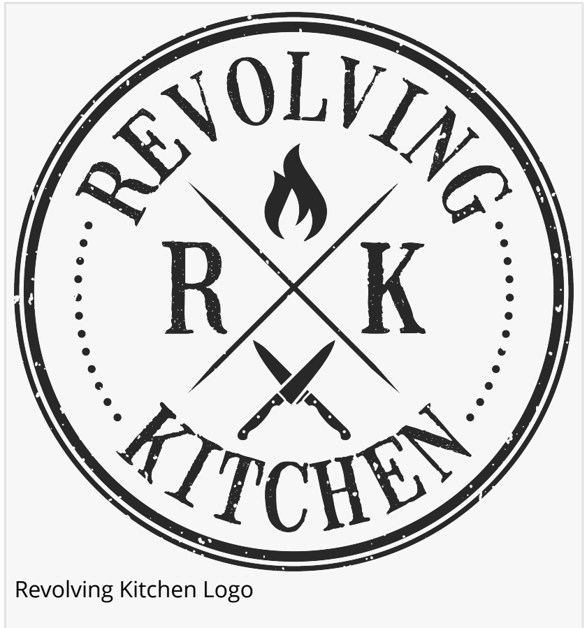
Revolving Kitchen Logo

Revolving Kitchen, an innovator in the food hall and kitchen rental space, has officially opened its newest location in Fairview, Texas. Following a successful soft opening on September 28, the food hall is gearing up for its highly anticipated grand opening on October 22, 2024. Located in the heart of Fairview, the Revolving Kitchen Food Hall offers foodies and families a unique dining experience with an array of culinary options, innovative features, and community-driven design.