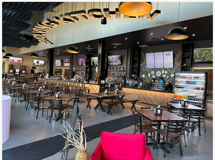
Revolving Kitchen view of dining and bar area

Pono Poke: Hawaiian Poke and Japanese Comforts – Sandwiches, Soba, and Udon.