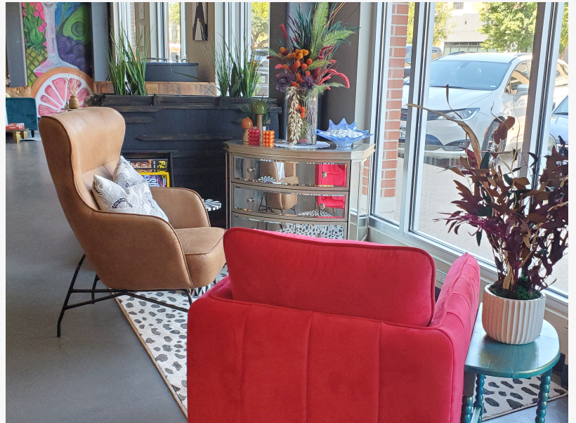
Cozy seating area