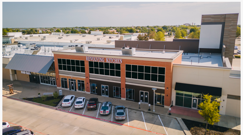
Revolving Kitchen Outside Building