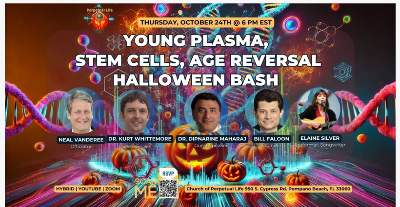
Church of Perpetual Life Hosts Spooktacular Halloween Event on Young Donor Plasma, Stem Cell Therapy, and Age Reversal