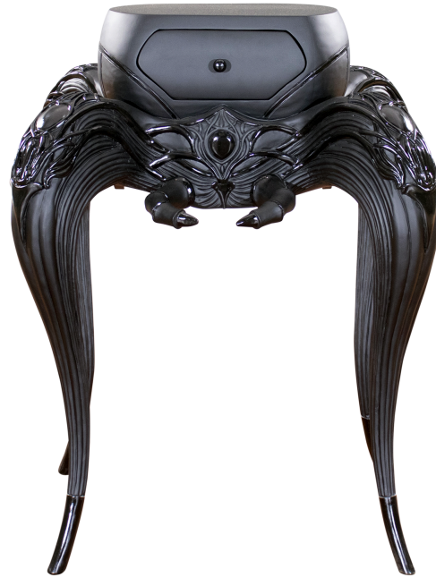
Arachnid Side Table by Haunt