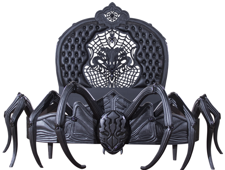
Arachnid Bed by Haunt