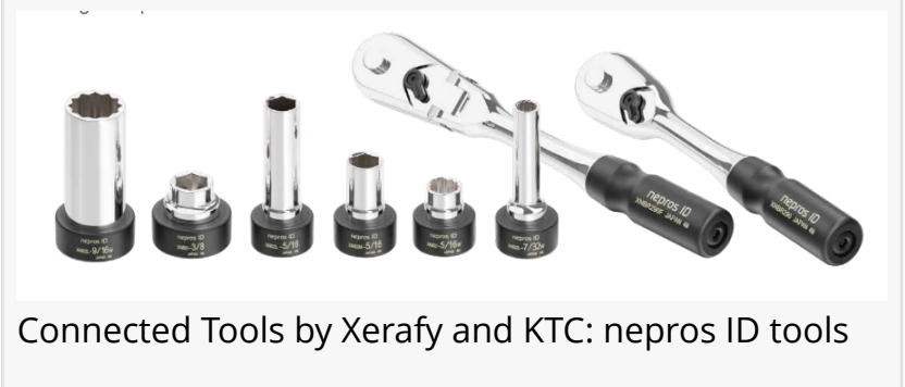
Connected Tools by Xerafy and KTC: nepros ID tools