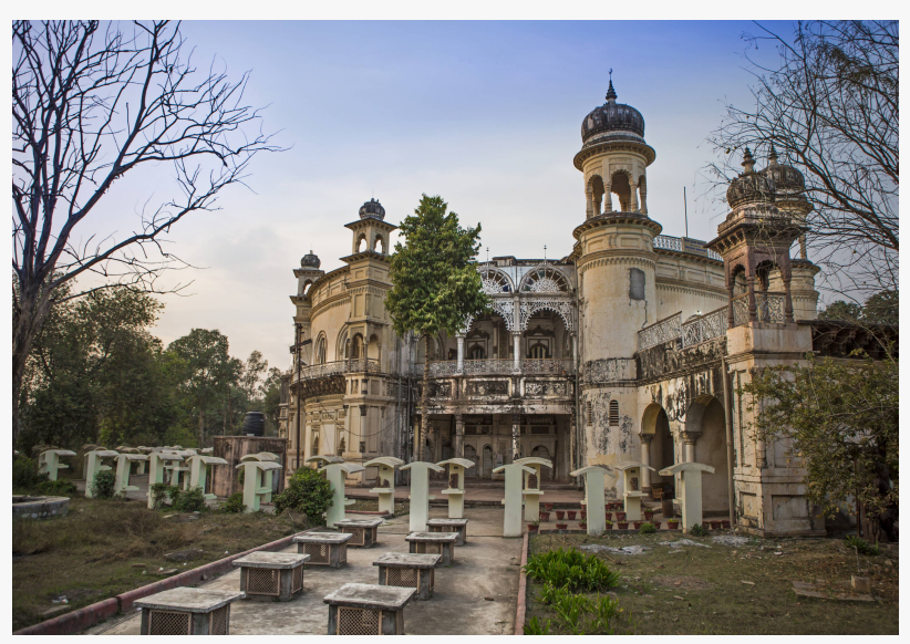
Venkat Bhavan in Rewa – a blend of royal architecture and cultural heritage