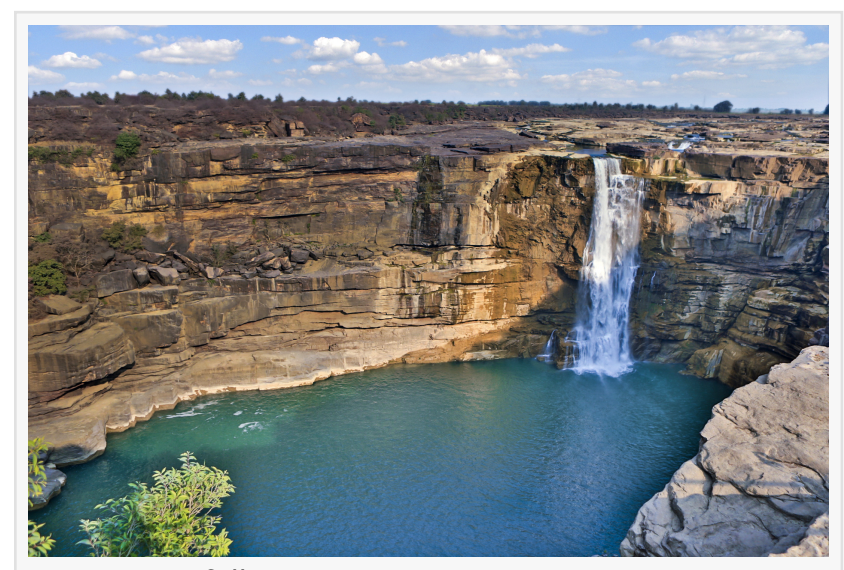
Keoti Waterfall in Rewa

BHOPAL, MADHYA PRADESH, INDIA, October 17, 2024 /EINPresswire.com/ --Madhya Pradesh, the Heart of Incredible India, is an offbeat multispecialty destination that is rich in history, culture, and natural beauty. Notably, Madhya Pradesh set a new tourism record in 2023, attracting 112.1 million tourist footfalls, three times the 34.1 million tourists in 2022. This surge in visitors is complemented by the state's continuous efforts to enhance accessibility for travelers, including the recent addition of the Rewa Airport. Located in the Vindhya region, Rewa Airport is now the sixth operational airport in the state, joining the ranks of Bhopal, Indore, Jabalpur, Gwalior, and Khajuraho. This new development is set to improve connectivity and boost tourism while also facilitating cargo movement across the region.