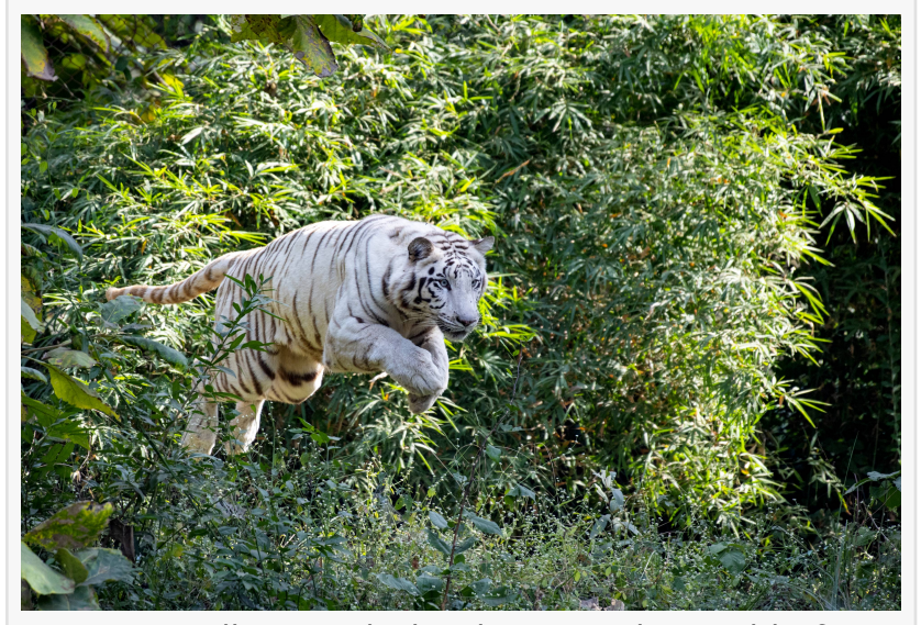
Rewa in Madhya Pradesh is home to the world's first white tiger