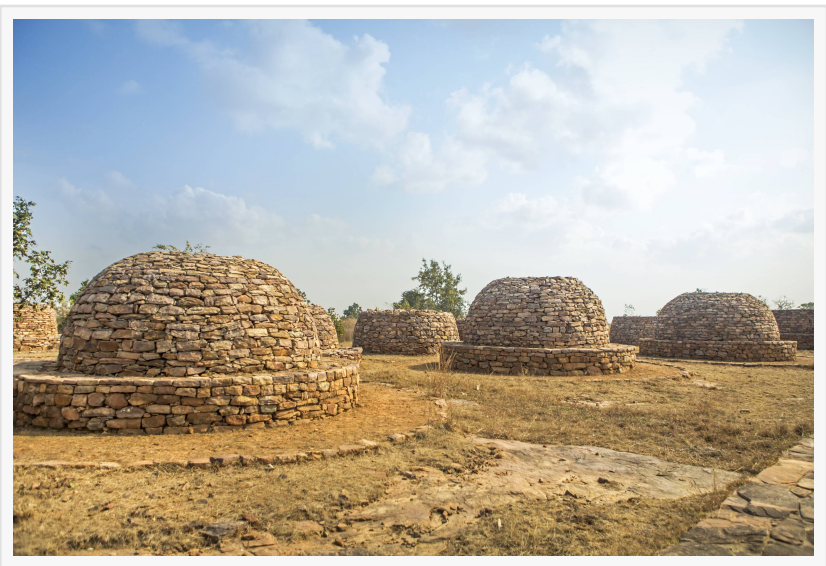
The ancient serenity of Duer Kothar Buddhist Stupa

ZM Madhya Pradesh Tourism Board email us here