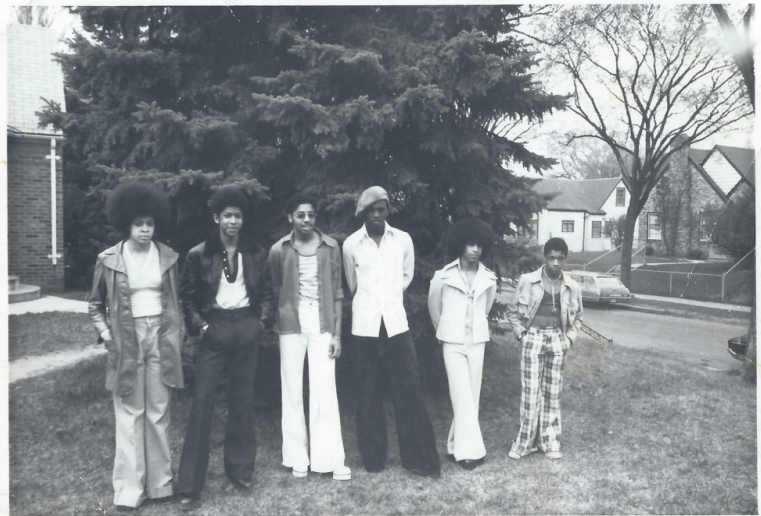
Prince's Childhood Band "Grand Central"