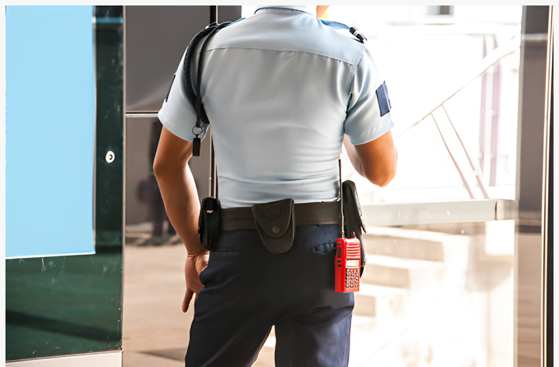
security for community centers