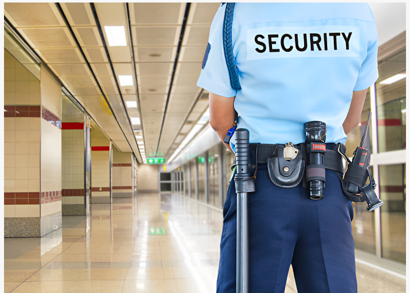
Security guard services for office buildings