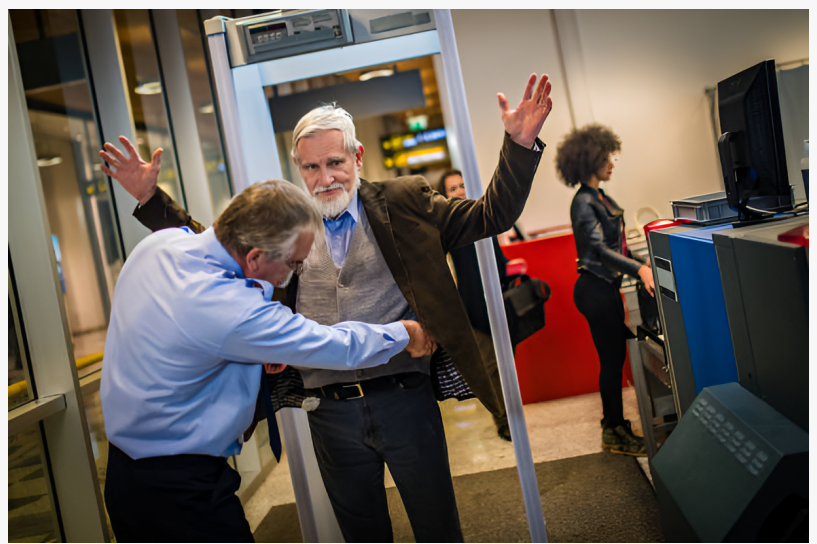
hospital safety and security