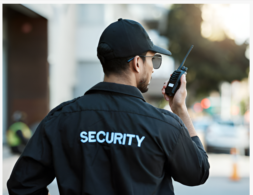
security guards company

undergoes a rigorous preparation program designed to equip them with the skills necessary to handle a broad spectrum of security challenges. Whether assigned to a bustling emergency room, a high-rise office building, or a parking lot, these officers bring a high level of expertise