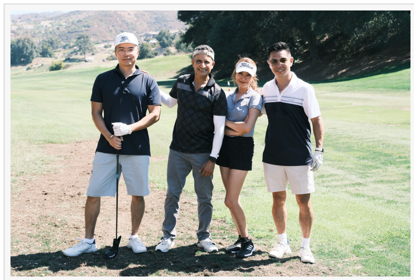
Golfers enjoying LATLC's 11th Annual Golf Tournament

This press release can be viewed online at: https://www.einpresswire.com/article/752634093