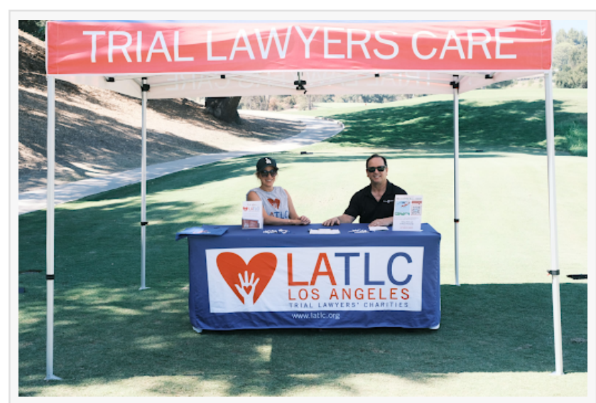
Volunteers at the LATLC Booth for the 11th Annual Golf Tournament