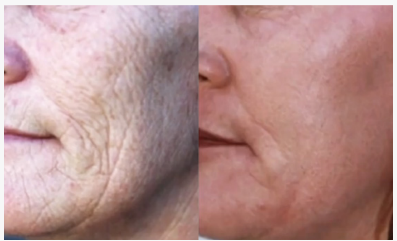
Before and after results of Dr. Simon Ourian's revolutionary non-surgical wrinkle removal treatment, showing visibly smoother and rejuvenated skin.

What sets this treatment apart is its non-invasive nature and minimal recovery time. Patients can return to their daily routines shortly after the procedure, making it an ideal option for those who want to avoid the prolonged healing periods associated with traditional cosmetic surgery. Early adopters of the treatment have reported significant improvements in the appearance of their skin, praising the procedure for its ability to deliver a more youthful, refreshed look. The quick recovery time and long-lasting results have made it particularly popular among individuals who value a natural, understated approach to aging gracefully.