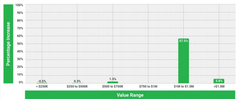
2024 Residential Increase by Value Range