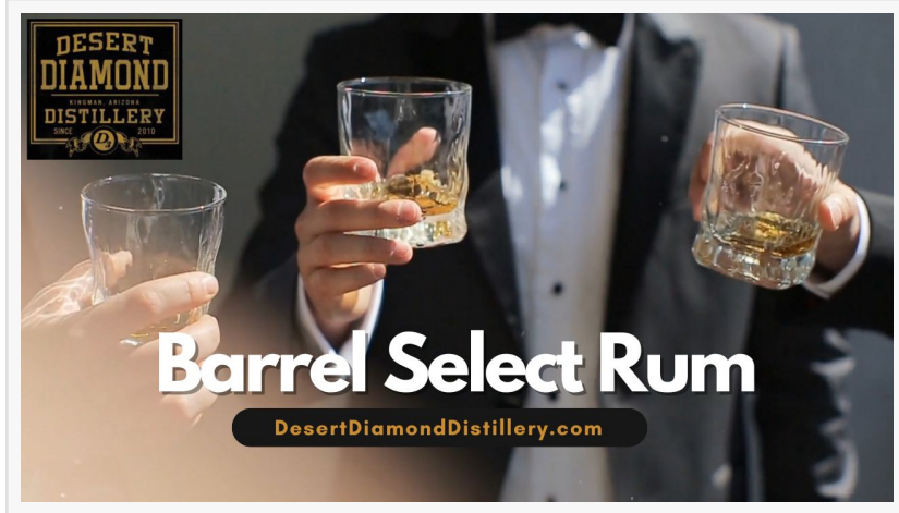
Desert Diamond Distillery Barrel Select Program

Participants in the Barrel Select Program visit the distillery to experience a mentored tasting of a