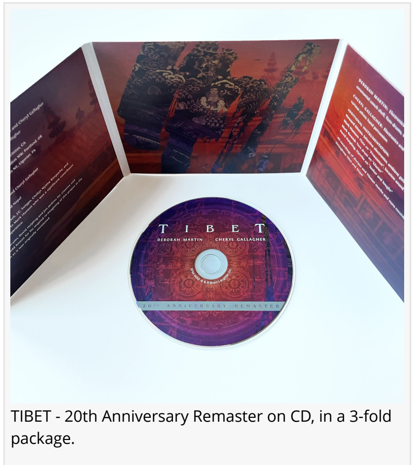
TIBET - 20th Anniversary Remaster on CD, in a 3-fold package.