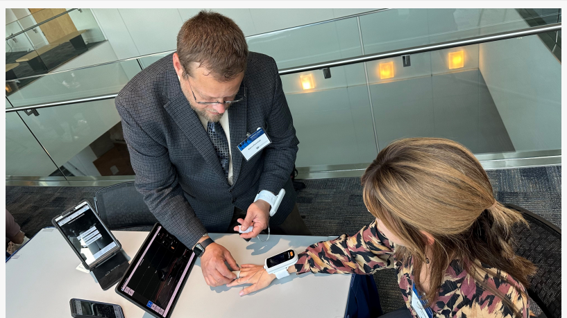
Woman wearing VitalStream noninvasive hemodynamic monitor.

“VitalStream can offer clinicians the continuous data they need to intervene earlier, potentially save the lives of new mothers.”