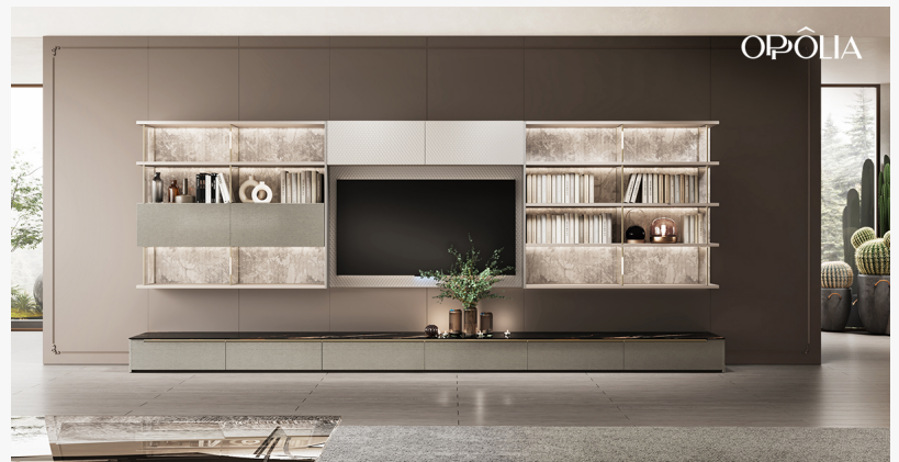
oppolia modern living room design