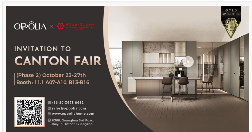
oppolia canton fair post