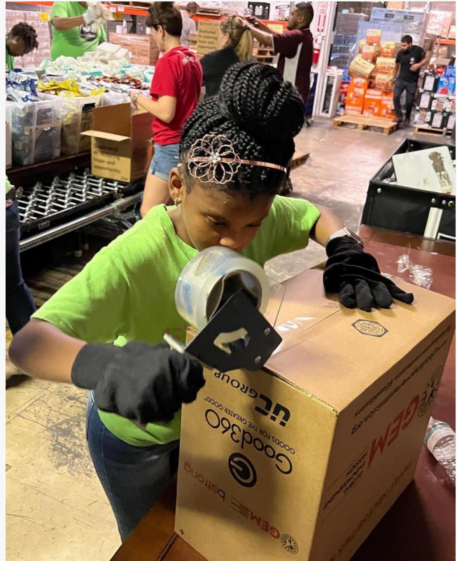
Embrace Girls member packs supplies after Hurricane Ian