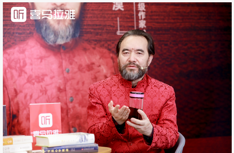
Writer Xue Mo