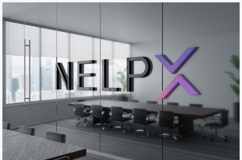
Nelpx Company Logo

to offer even more comprehensive solutions and actively drive digitalization in companies. With tailor-made concepts and the expertise of our specialists, we provide real added value and