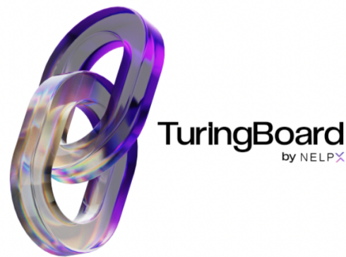
Nelpx Turing Board