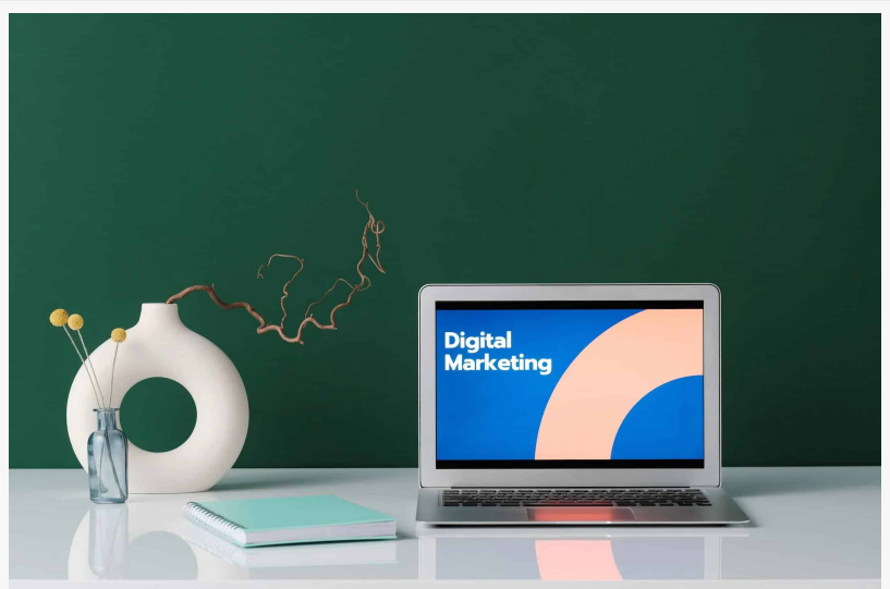
Digital Marketing Agency