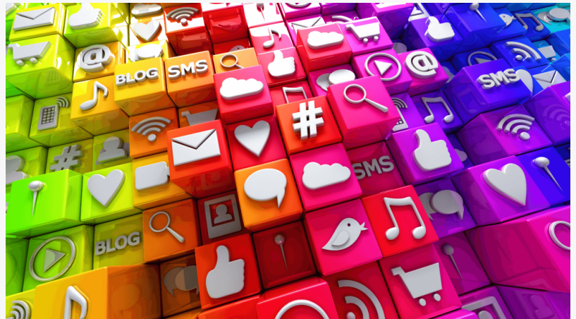
Social Media Marketing