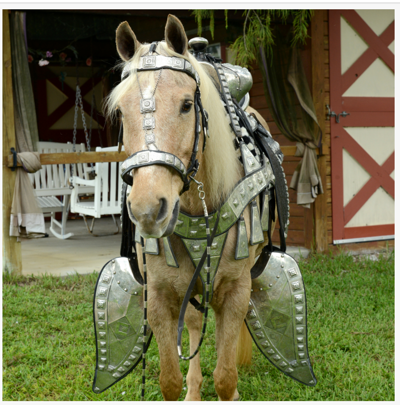
One of two Edward Bohlin parade saddles that took PBMA's team on a photography field trip to capture images of the important pieces. Equine model Diamond was well-paid in carrots.

Early crowd favorites among online bidders include Hunt Slonem's bunny paintings with diamond dust glitter, a