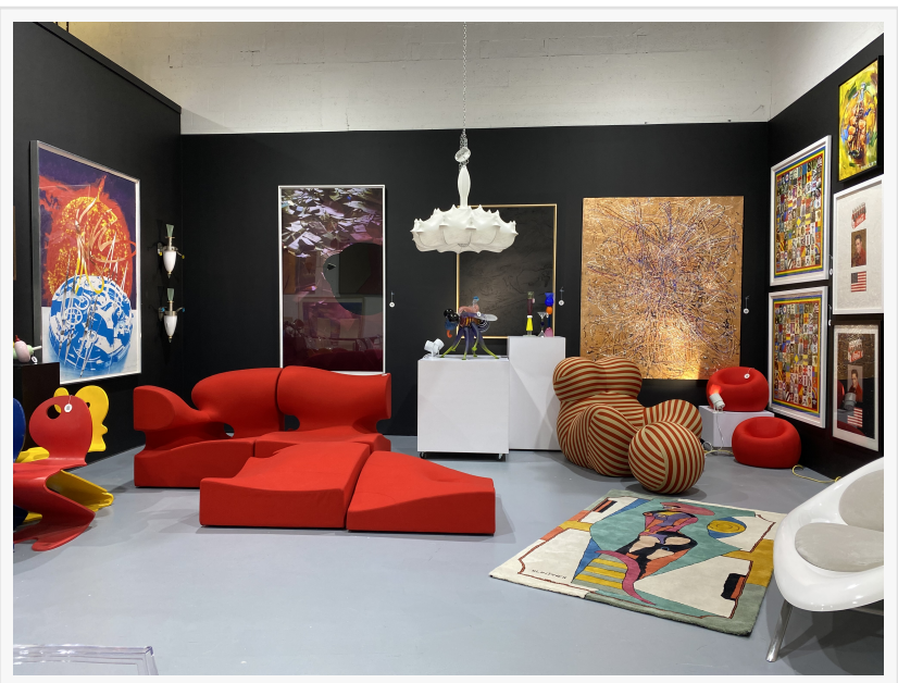
One of the colorful rooms of Palm Beach Modern Auctions' exhibition space, where potential buyers can view items in person before the sale.

"Whether you're looking at a sofa, a painting, or a diamond bracelet, nothing compares to seeing the items firsthand," says auctioneer and coowner Rico Baca. "These are unique pieces to experience, representing fascinating techniques, important genres, and parts of modern history. We offer online and phone options for