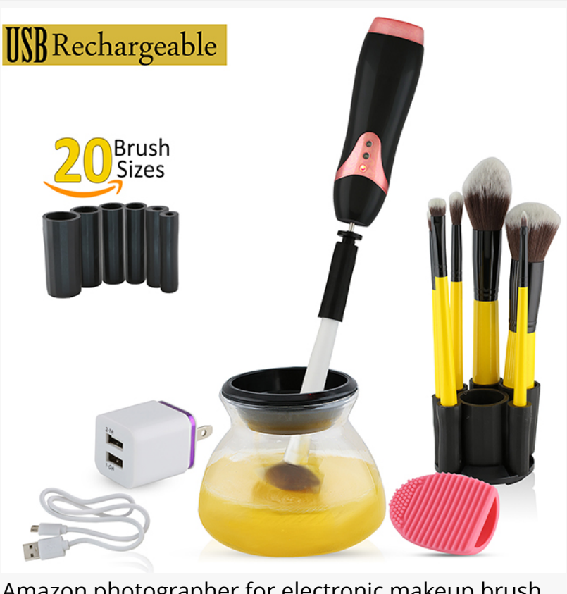
Amazon photographer for electronic makeup brush cleaner

Ghost mannequin photography, also known as invisible mannequin photography, has become a popular choice for clothing retailers. It allows garments to appear as though they are being worn, but without the distraction of a live model. The result is a clean, 3D-like image that focuses solely on the product, offering a realistic representation of how the item will look on a customer. This type of photography is particularly effective in e-commerce, where customers cannot physically touch or try on products before purchasing.