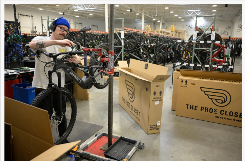
TPC Bike Refurbishing