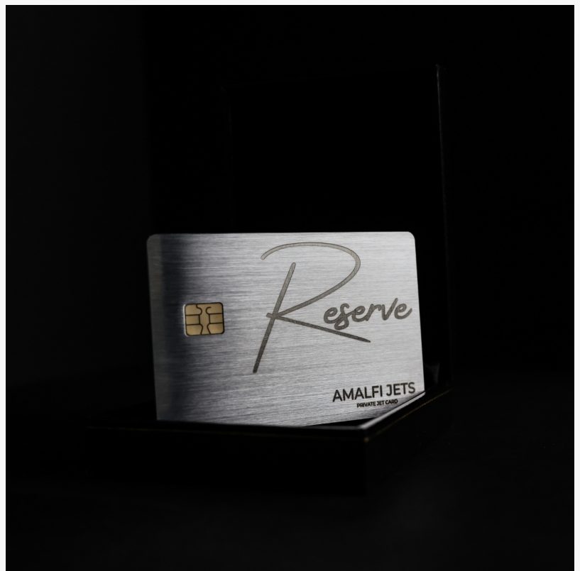
Amalfi Reserve Membership

LOS ANGELES, CA, UNITED STATES, October 18, 2024 /EINPresswire.com/ -- Amalfi Jets Inc., the premier global provider of private jet charters and jet card services, announces the rare opportunity to access The Amalfi Reserve – an exclusive membership program. Throughout the month of October, individuals who download the Amalfi Jets app will unlock a 30-day complimentary trial of The Amalfi Reserve, typically reserved for those paying the $500 monthly membership fee.