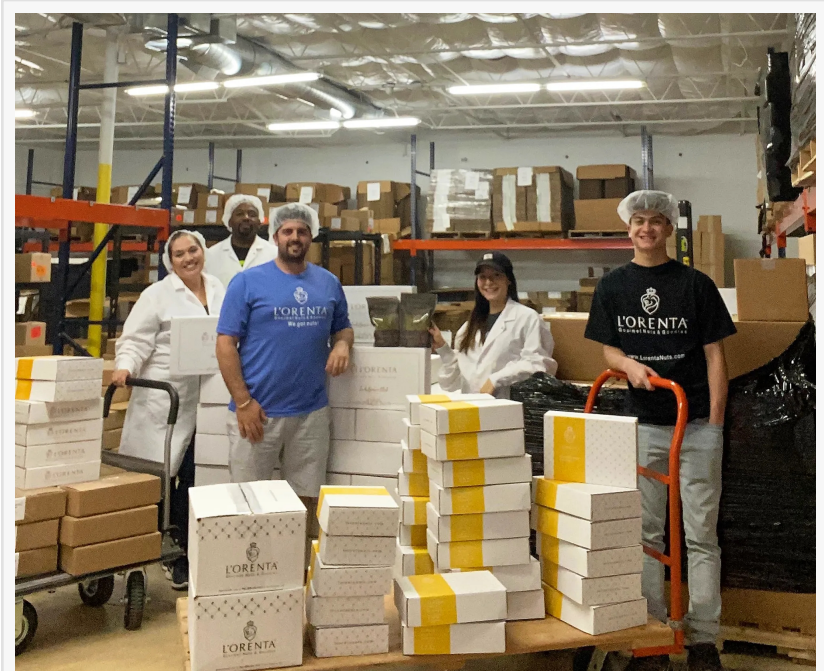
Team members of L'Orenta Nuts in the Climate controlled Warehouse

To explore our holiday catalog, visit: Year-round holiday Gifts of Boxed Candy, Chocolates, Nuts and Snack Mixes