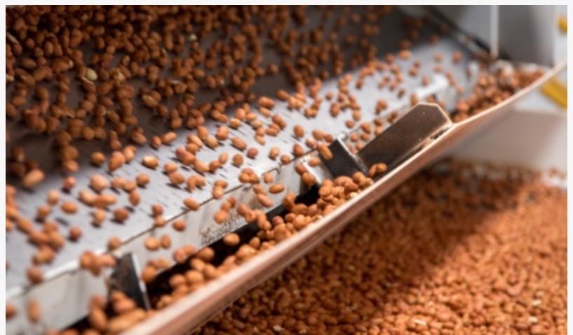
Roasted Nuts falling off Conveyor