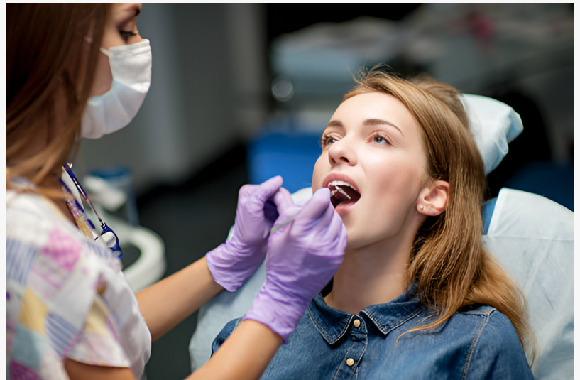
Dental Care Services-