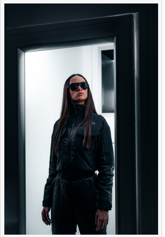
Icelandic clothing brand Icewear: Woman in black jumpsuit.

Until the introduction of Icewear's wool-filled outdoor clothing, wool was traditionally spun to be woven, crocheted or knitted, making garments such as the iconic Icelandic wool jumper called "lopapeysa". The lopapeysa is richly decorated with traditional patterns around the shoulders. However, the lopapeysa jumper is more than appealing to the eye, due to its natural properties of Icelandic wool, it is also an extremely practical garment. Icelandic sailors, horsemen, farmers and many native Icelanders can attest to this, Icelandic wool with its unique properties has kept them warm and well for many generations.