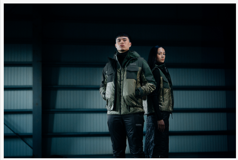
Couple showing Black sheep collection. Icelandic wool filled apparel