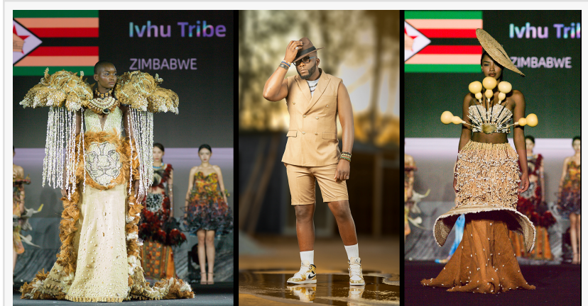
The Avant-Garde Visionary of African Fashion

With a keen eye for detail and a deep understanding of African heritage, Mandizera's designs are a fusion of traditional and contemporary elements. His collections feature a mix of hand-woven fabrics, intricate beadwork, and modern silhouettes, creating a unique and striking aesthetic that has captivated the fashion world. This month showcasing his love for