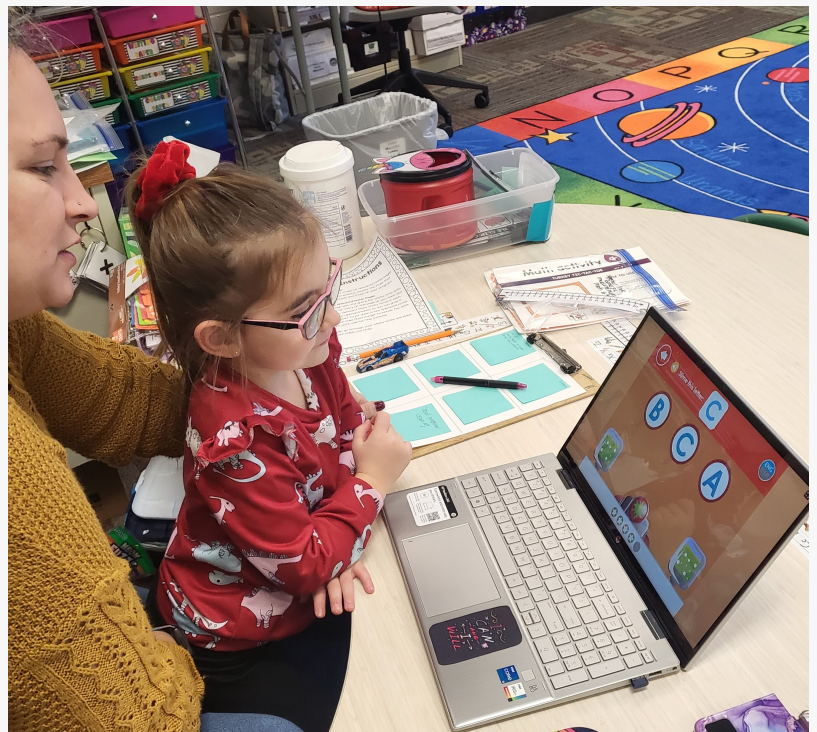
A students practices literacy lessons on Footsteps2Brilliance platform.

WASHINGTON, DC, UNITED STATES, October 21, 2024 /EINPresswire.com/ -- Berkshire Local School District is expanding an early childhood literacy program providing students and families throughout the community with access to Footsteps2Brilliance's evidence-based literacy curriculum. The expansion extends the program, which is currently being used in PreK classrooms, to all students in Kindergarten through 3rd grade. Footsteps2Brilliance is aligned with both the Science of Reading and the core curriculum that teachers are using in the classroom. This will allow teachers to reinforce classroom lessons while providing fun, interactive practice to students.