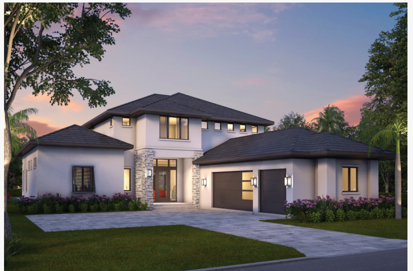
Janssen Custom Home Builders home in Tesoro Club