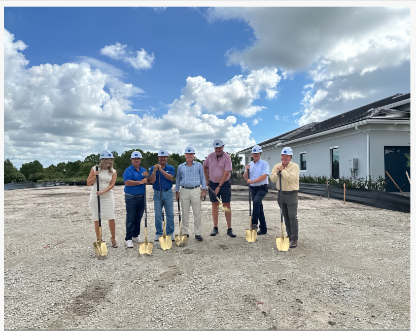
Janssen Custom Home Builders Breaks Ground in Tesoro Club

Builders in Tesoro Club are WCI Communities by Lennar and Toll Brothers, along with signature