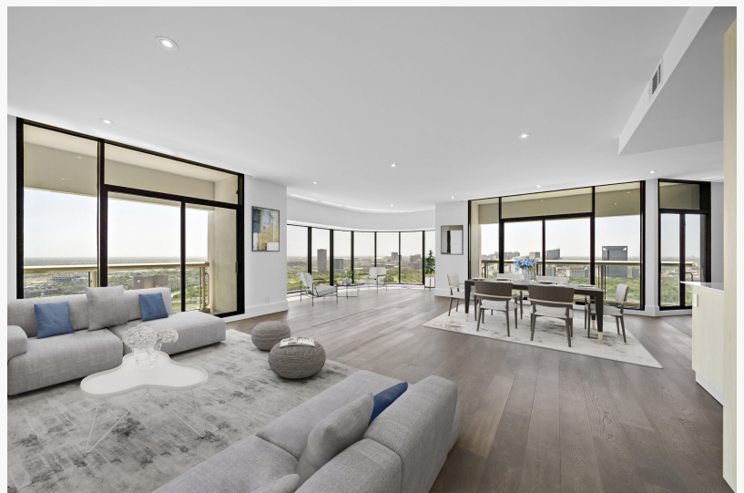
High rise condos in Houston

The renovations at The Parklane include a complete redesign of common areas aimed at fostering a sense of community among residents. The lobby has been updated with contemporary decor and comfortable seating arrangements, encouraging social interaction and providing a welcoming space for gatherings. The redesign also features artwork from local artists, supporting the Houston arts community and enriching the aesthetic of