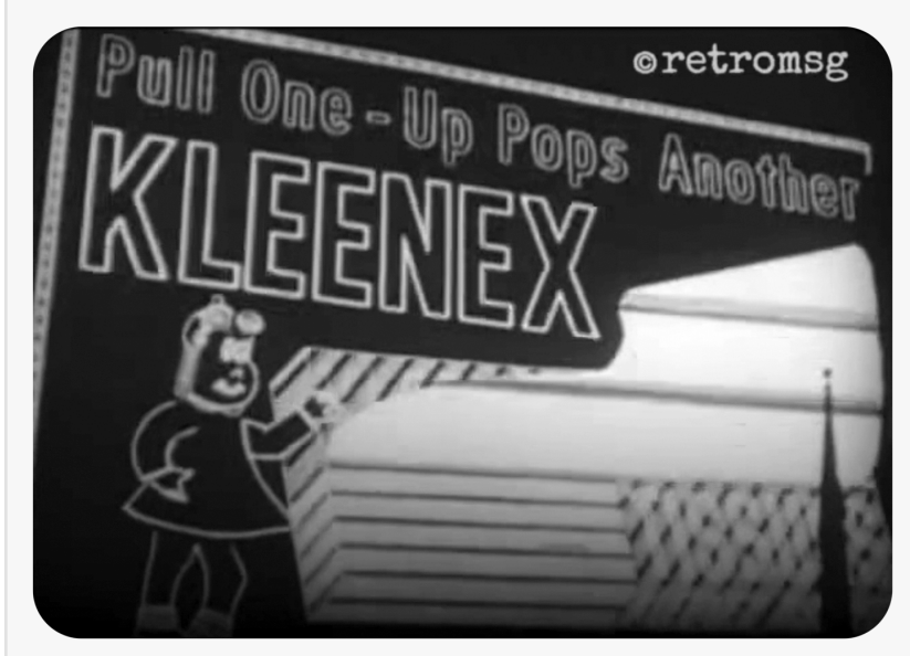
Historical Times Square billboards now included in retro message.