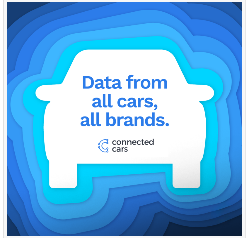
Real-time data from all cars, all brands for leasing companies

Many leasing companies are missing out on the full potential of telematics, offering only basic features as part of their full-service leasing agreements. This limits their ability to enhance both fleet operations and customer satisfaction. However, telematics can offer much more, enabling companies to provide real-time tracking, predictive maintenance, and compliance support while improving operational efficiency, residual values, and customer