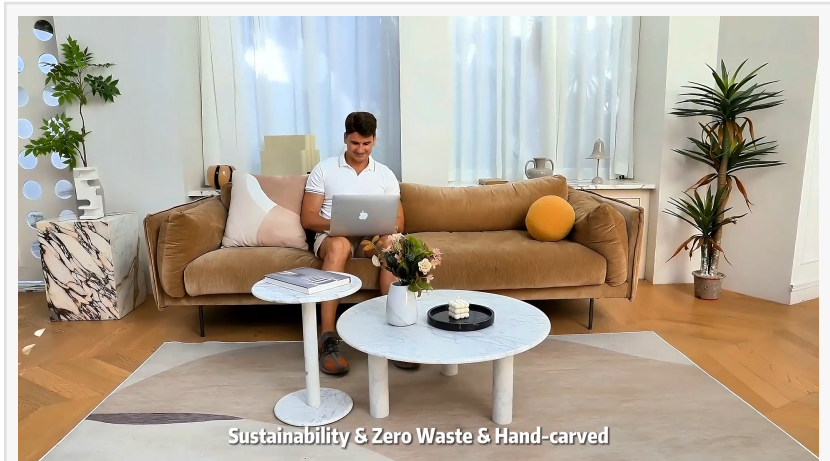
OIXDESIGN RoundHaven White Marble Coffee Table and Side Table

Revolutionizing Luxury for Compact Living