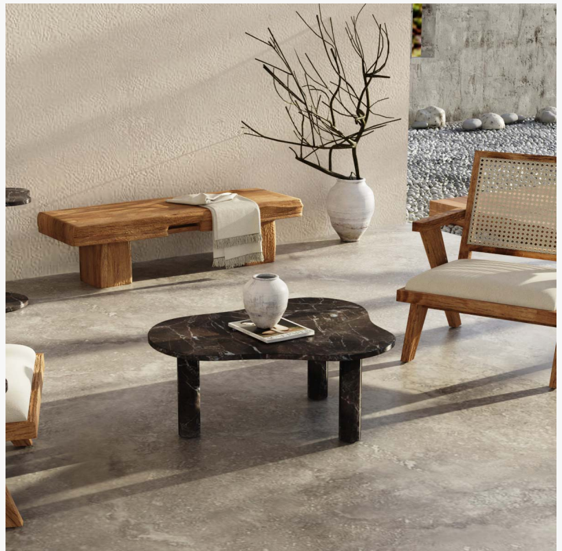
OIXDESIGN CloudDream Black Marble Coffee Table