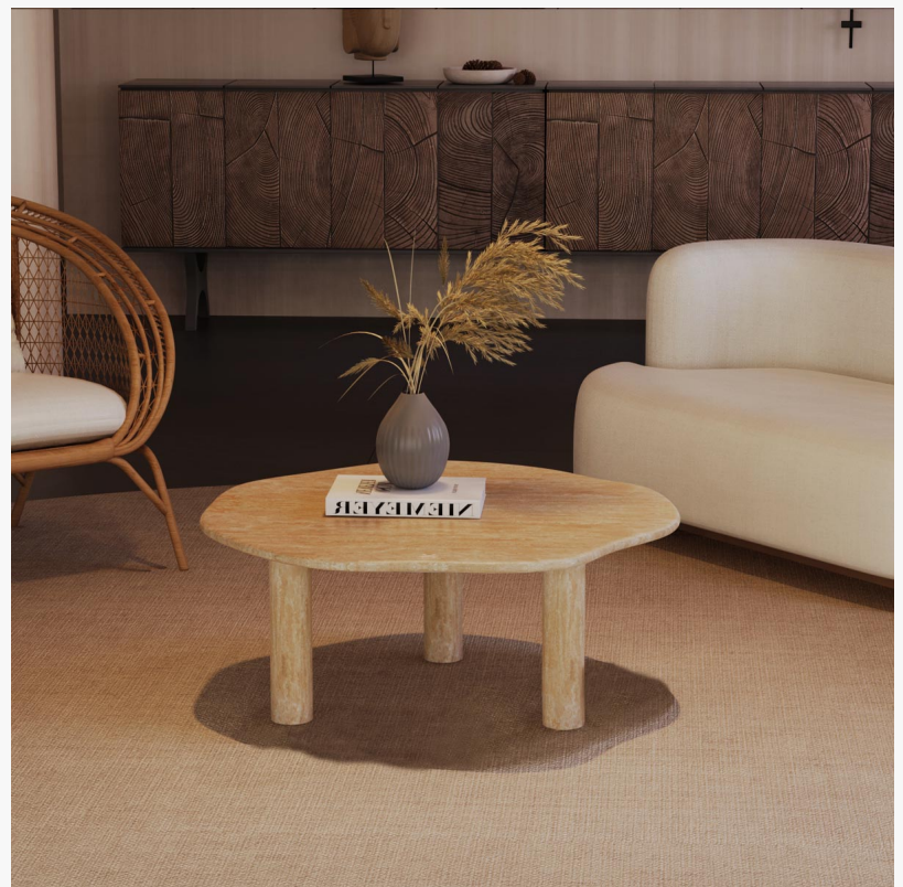
SunAura Travertine Stone Coffee Table