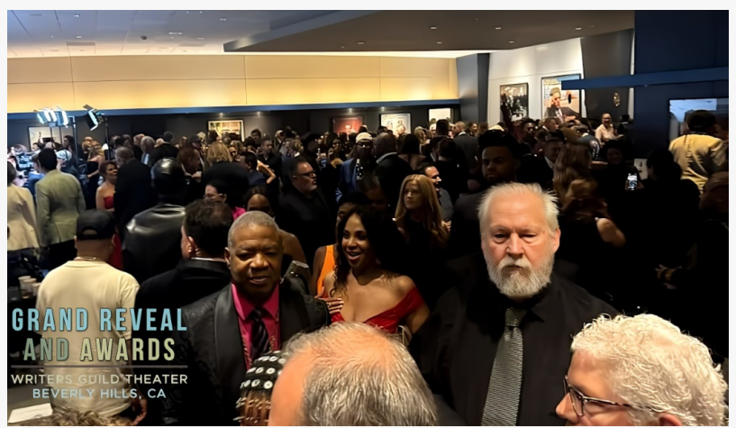
Mindatorium Grand Reveal, Writers Guild Theater, Beverly Hills, CA

Sector 5 - The Tribe Community. This is where like-minded, caring, sharing people add value to