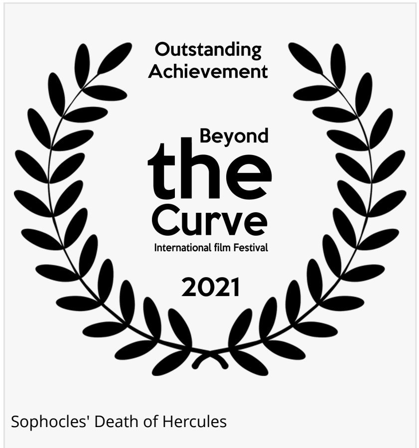
Sophocles' Death of Hercules

The efforts of ArtsPR have not gone unnoticed, as they have received numerous accolades and awards for their work. From Philadelphia to Berlin, Bali to Kuwait, their impact has been felt globally. Most notably, they have won Film and Book Awards in various prestigious events, including those in Milan, Rome, Paris, and Spain. Additionally, more poetic work has been recognized in "organized labor," with five book awards on AuthorHouse.com and others on Lulu.com.