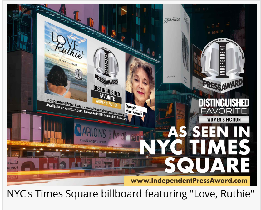
NYC's Times Square billboard featuring "Love, Ruthie"