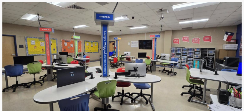
Brand New SmartLab Facilities at Kirby STEM Academy.