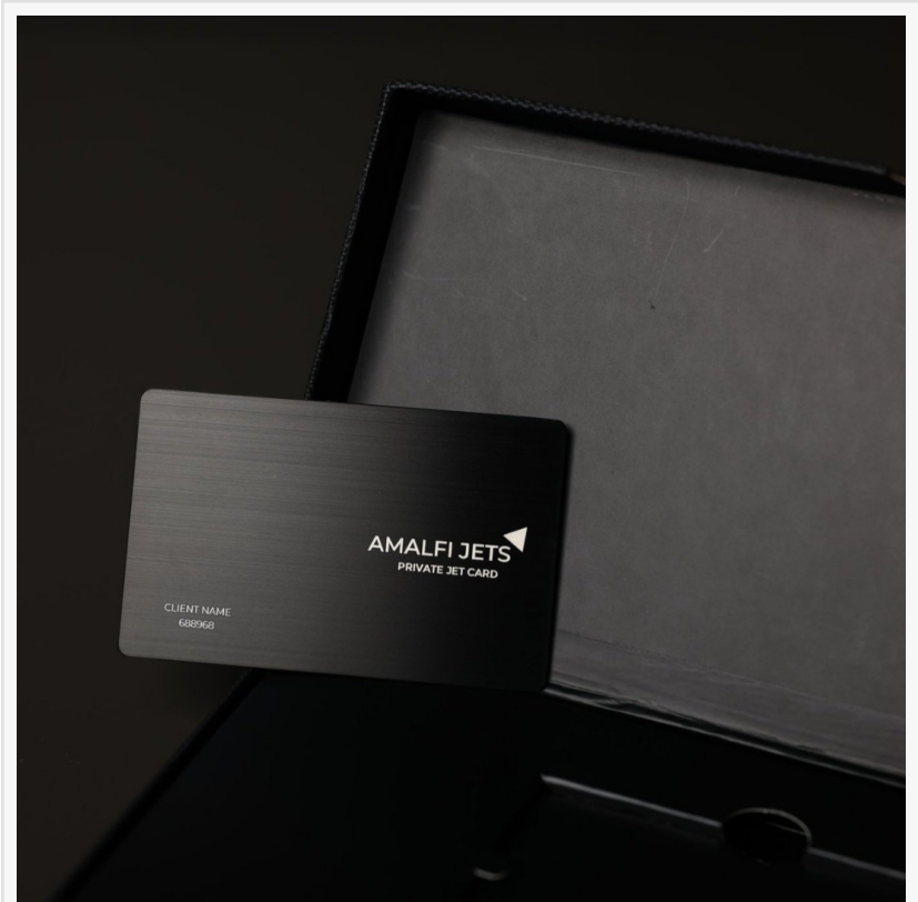
Amalfi One Jet Card