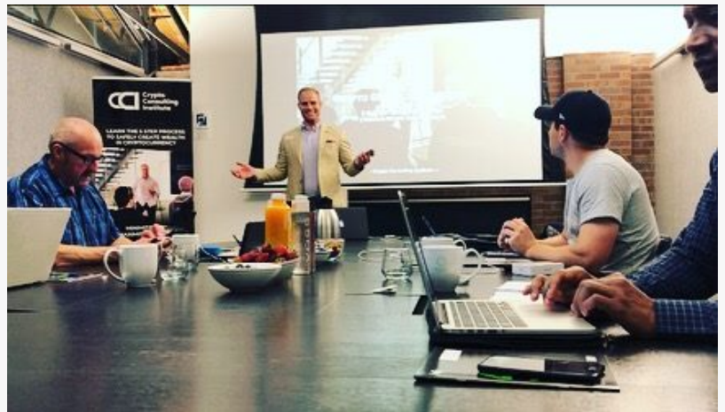
VIP Immersion shot