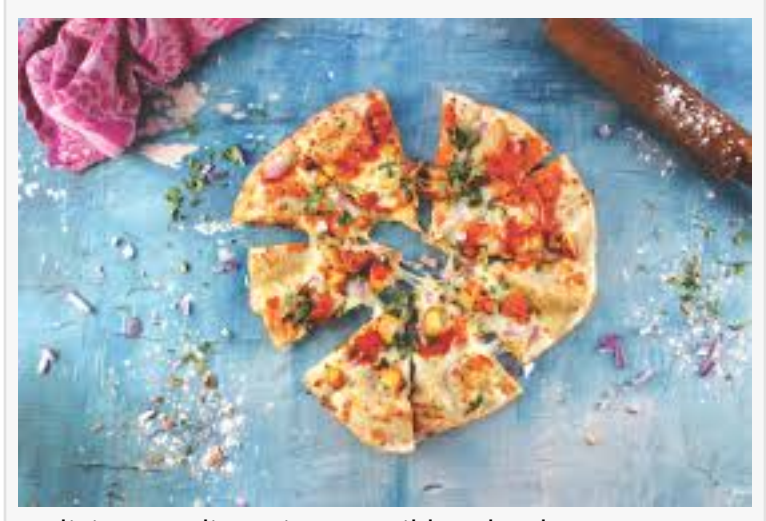
Delicious Indian Pizza at Tikka Shack